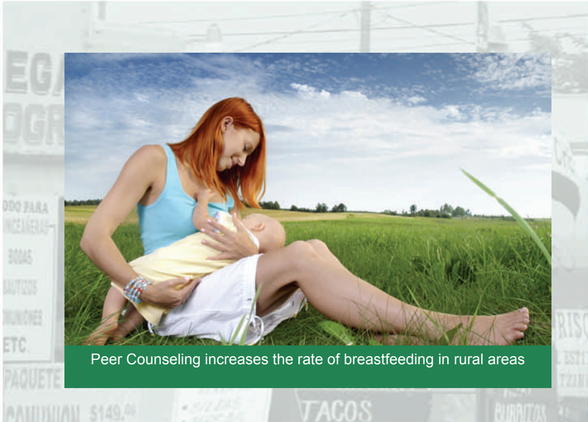
Peer Counseling increases the rate of breastfeeding in rural areas

Breastfeeding is recognized by medical experts and policy makers worldwide as a powerful, low-cost preventive health intervention. Breastfeeding reduces infants' risk for childhood obesity and protects mothers and infants from short- and long-term health problems, saving lives as well as healthcare dollars. The protection provided by breastfeeding is strongest when babies receive no foods and fluids other than breast milk for the first six months of life. Unfortunately, only 30% of children in the Missoula WIC program are breastfed exclusively at 3 months of age, although 83% of mothers initiate breastfeeding. Low-income children, who are most vulnerable to chronic diseases such as obesity and diabetes, are the least likely to be breastfed exclusively.